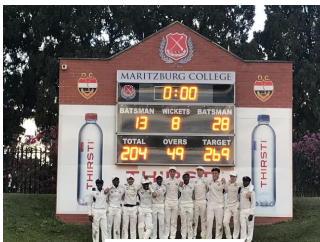
Northwood 1 st XI

Senior Interhouse Squash will take place on Wednesday 10 October and Junior Interhouse Squash will take place on Thursday 11 October. Both will run from 14:30 - 15:30