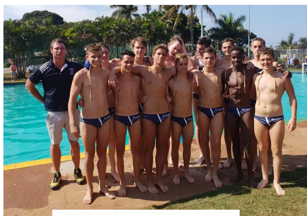
Northwood 1 st Water Polo