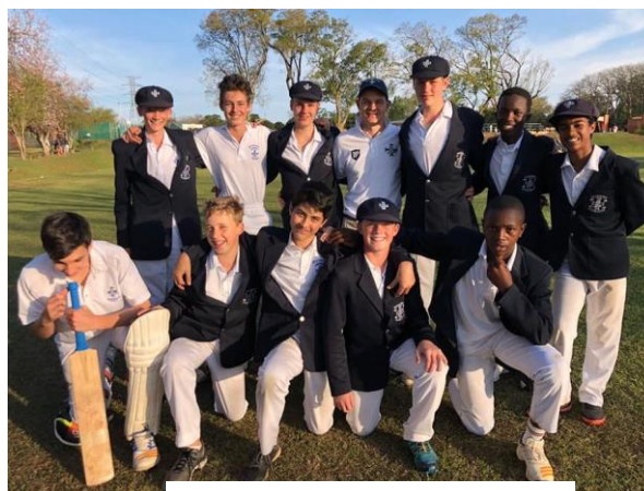
Northwood u14A Cricket