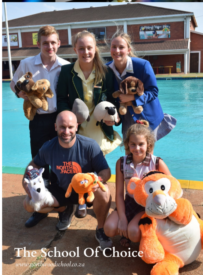
The School Of Choice www.northwoodschool.co.za

For further info please email: marketing@nwood.co.za