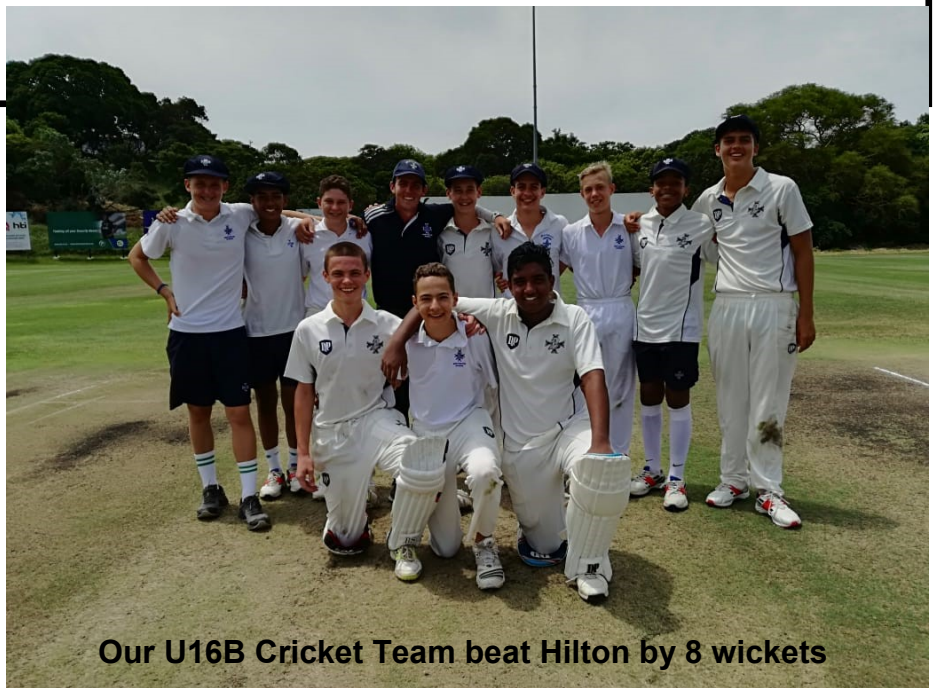
Our U16B Cricket Team beat Hilton by 8 wickets

For all extra mural details with regards to fixtures, notices, practice times and transport arrangements please visit www.northwoodschoolsport.com . Remember to create a shortcut on your home screen of your mobile device for a very user friendly version of the site.