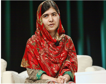
Malala Yousafzai (born 12 July 1997)

I always thought Malala's story started when she was shot and was confused about why she would be airlifted to England for treatment. But, when you read her bio you realise that she has been an activist for education for girls from a very young age.