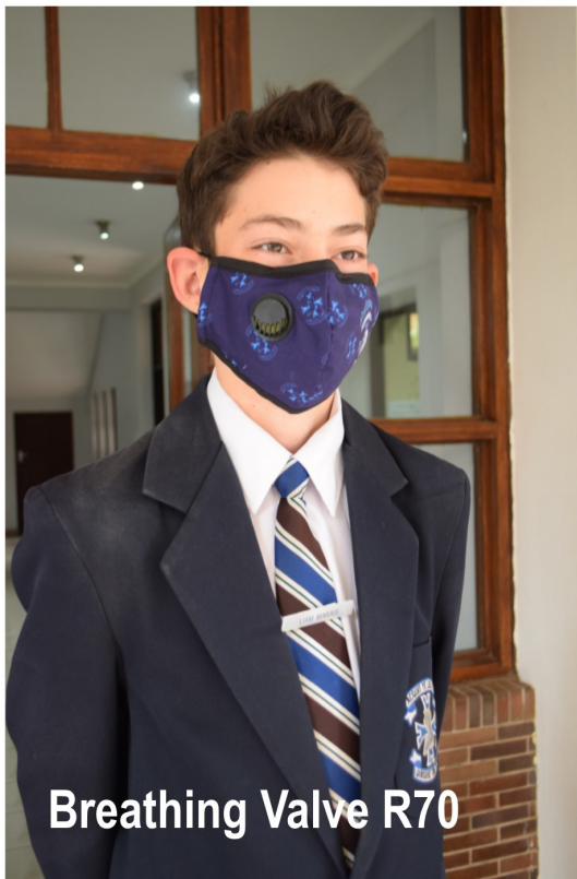
Breathing Valve R70

Northwood branded masks are available for sale from the school's Back Office, cash or card payments accepted.